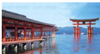
Miyajima (Hiroshima city)

Miyajima and the Atomic Bomb Dome, World Heritage sites, and many other historic buildings are located in Hiroshima. In addition, there are many sightseeing spots with an abundance of nature.