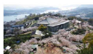
Senkoji temple (Onomichi city)