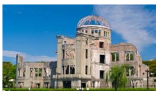
Atomic bomb dome (Hiroshima city)