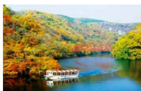
aishakukyo (Shobara city)